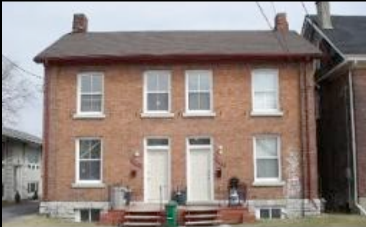
249-251 Division Street- $249 500.00 each

SGPS Reserves: $250 - $300 000.00 TD Interest Rate: 0.7% Annual Revenue: $300 000.00 x0.7% $2 100.00